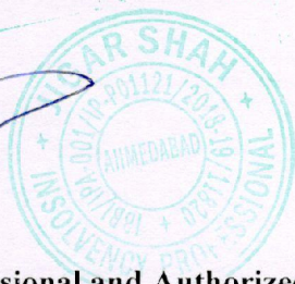
JIGAR SHAH (Resolution Professional and Authorized Signatory) IBBI/IPA-001/IP-P01121/2018-19/11820

Regd. Office : F-12, Ground Floor, Sangam Arcade, Vallabhnbhai Road, Vile Parle (West), Mumbai - 400 056 INDIA.